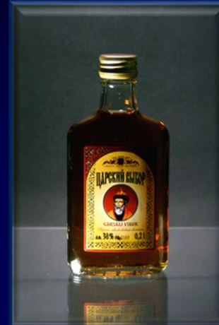
Царский выбор (Tsarskiy vibor)

This drink, designed for our partners, is in line with our philosophy – original recipe, unique taste, and the highest quality of every ingredient that we use.