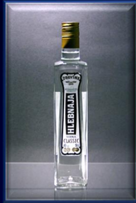
Hlebnaja Classic (Hlebnaya Classic)

Those who value classical taste of vodka will appreciate Hlebnaja Classic for its smooth and genuine purity. For this premium vodka, we use the highest quality grain spirit and freshly purified water. Multiple silver filtrations leave nothing but the perfectly clear and mild taste.