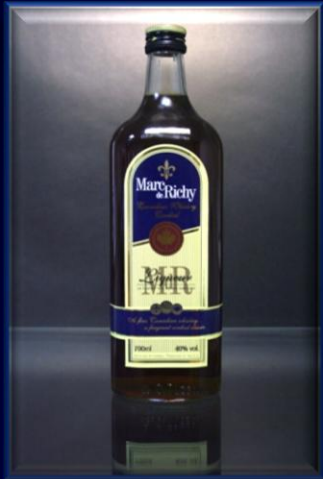
Marc de Richy

The result of another cooperation, became a liquor «Marc de Richy». We turned to an old recipe of Canadian artists, having a unique drink with a pleasant, unique and smooth taste. The basis for the liquor was imported from Canada in oak barrels whiskey, and also absorbed by the earth and the sun's energy honey, collected on Latvian apiaries, which gives the drink a pleasant aroma and unforgettable taste. This drink will make your story even better!